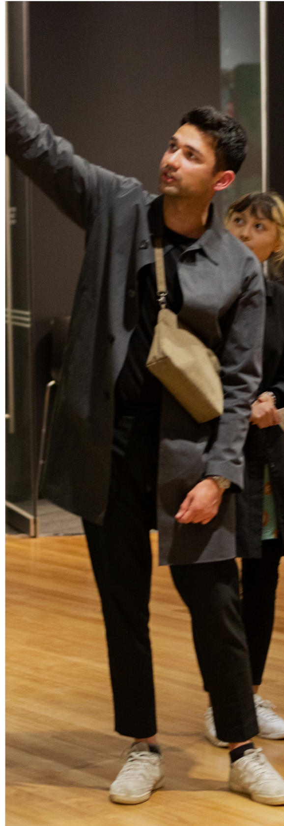
Bad Art Night, 2019.