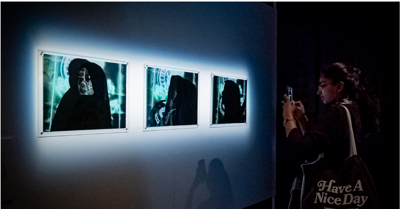
Image: Installation view, Emergent 2020: VCE Graduate Showcase , Bunjil Place Studio, 2021, Maham Umar, phosphorescence , 2020.