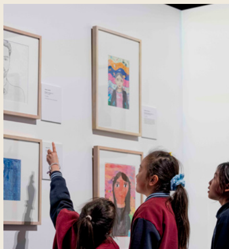
Students viewing artwork in Young Archie Narre Warren. Installation view, Young Archie Narre Warren , Bunjil Place Studio, 2022.