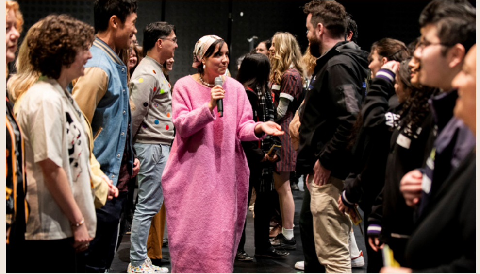
Image: Creative Industries Careers Day 2024.

General Capabilities: Critical and Creative Thinking, Ethical Understanding, Personal and Social Capability, Intercultural Understanding