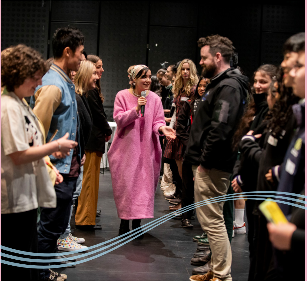
Image: Creative Industries Careers Day 2024.