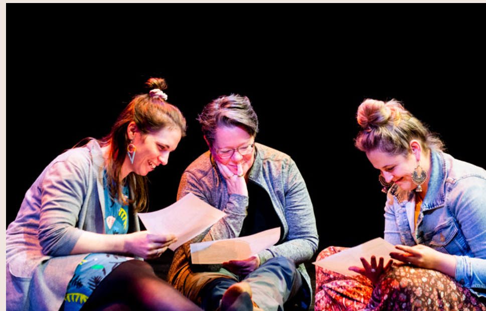
Image: Contemporary Indigenous Theatre Teacher Professional Learning, Bunjil Place Studio, 2023.