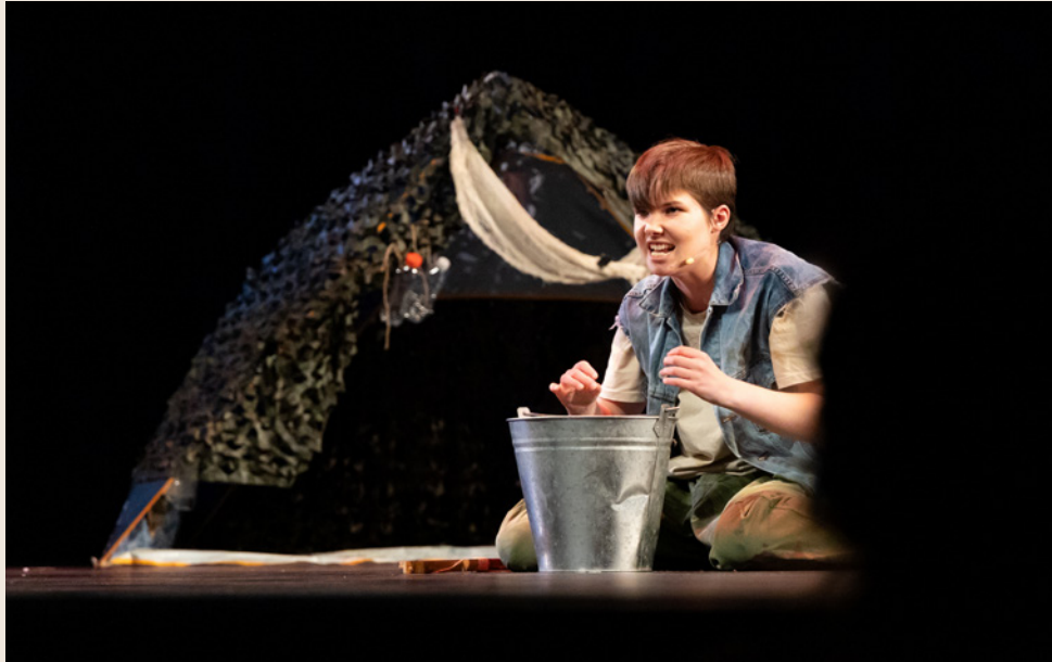
Image: Emergent 2024: Graduate Showcase, Bunjil Place Theatre.