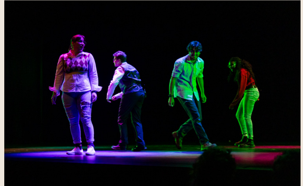
Image: Emergent 2024: Graduate Showcase, Bunjil Place Theatre.