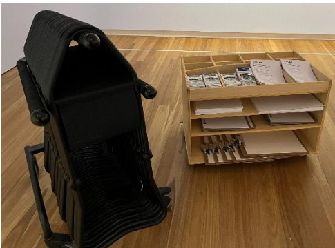
The black stools and drawing art supplies you can borrow.