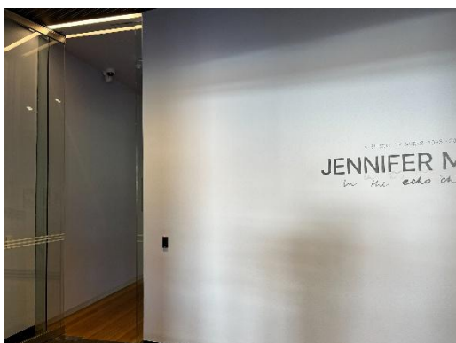
Door on the left for exhibition entry.