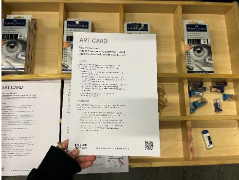
The Art Card you can take home. The trolley to return your art supplies to.