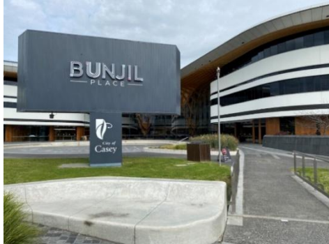
View of Bunjil Place.