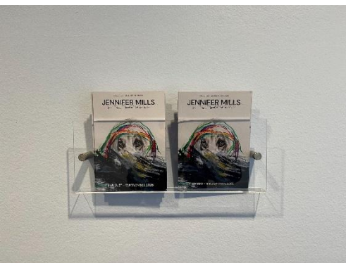
Exhibition pamphlet you can take home.