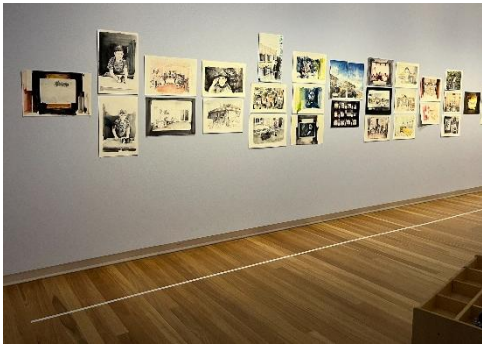
Example of white line to stand behind when viewing artwork.