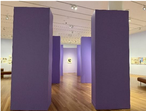
The room you can enter to view artwork.