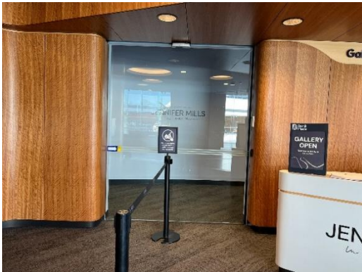
Main door of the gallery. The gallery desk is on the right.