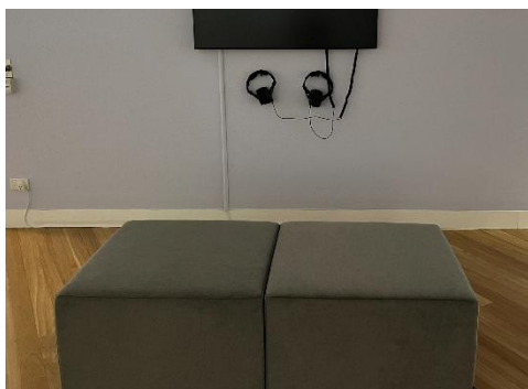
Example seat you can sit on and headphones you can wear to watch video.