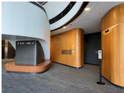
The entrance to the bathrooms. The men's toilets are to the left of the staircase and the women's and gender-neutral toilets are to the right of the staircase.