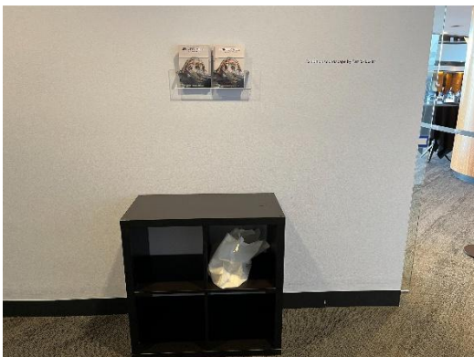
Shelf for items that are not allowed in the gallery.