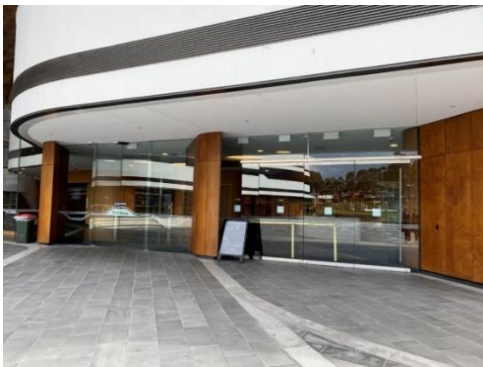
The right-side entrance to Bunjil Place.